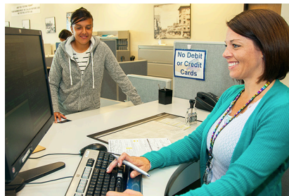
7 Steps to Exceptional Customer Service