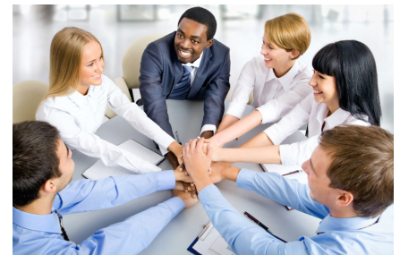
Personal Productivity and Professional Accountability